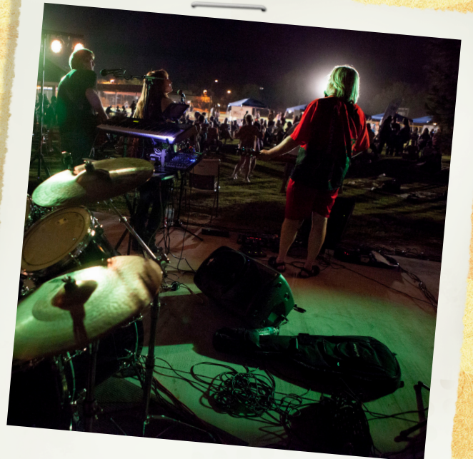
BEER & WINE